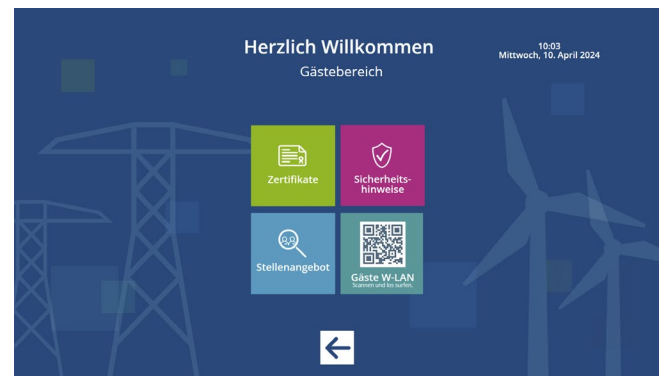
Figure 2: Guest area with public information

The guest area (see Fig. 2) is freely accessible. Clicking on the green button labelled 'Guest' takes you to the guest area. General certificates and safety instructions are available here. Visitors can find out about correct behaviour in the company. Job advertisements and access to the guest WiFi are also provided.