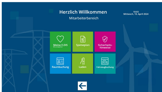
Figure 3: Employee area with sensitive content

Defined variations allow different content to be displayed depending on the location. Each terminal at the eight different locations displays different content. The terminal at the Falkensee location, for example, displays a text field with the content 'Welcome to Falkensee' and contains location-related data and information in the 'Safety instructions' (german: Sicherheitshinweise) and 'Menu' (german: Speiseplan) areas. The terminal in Potsdam displays the text 'Welcome to Potsdam' and the specific location information. Variations can be set and determined with little effort within SiteKiosk Online.